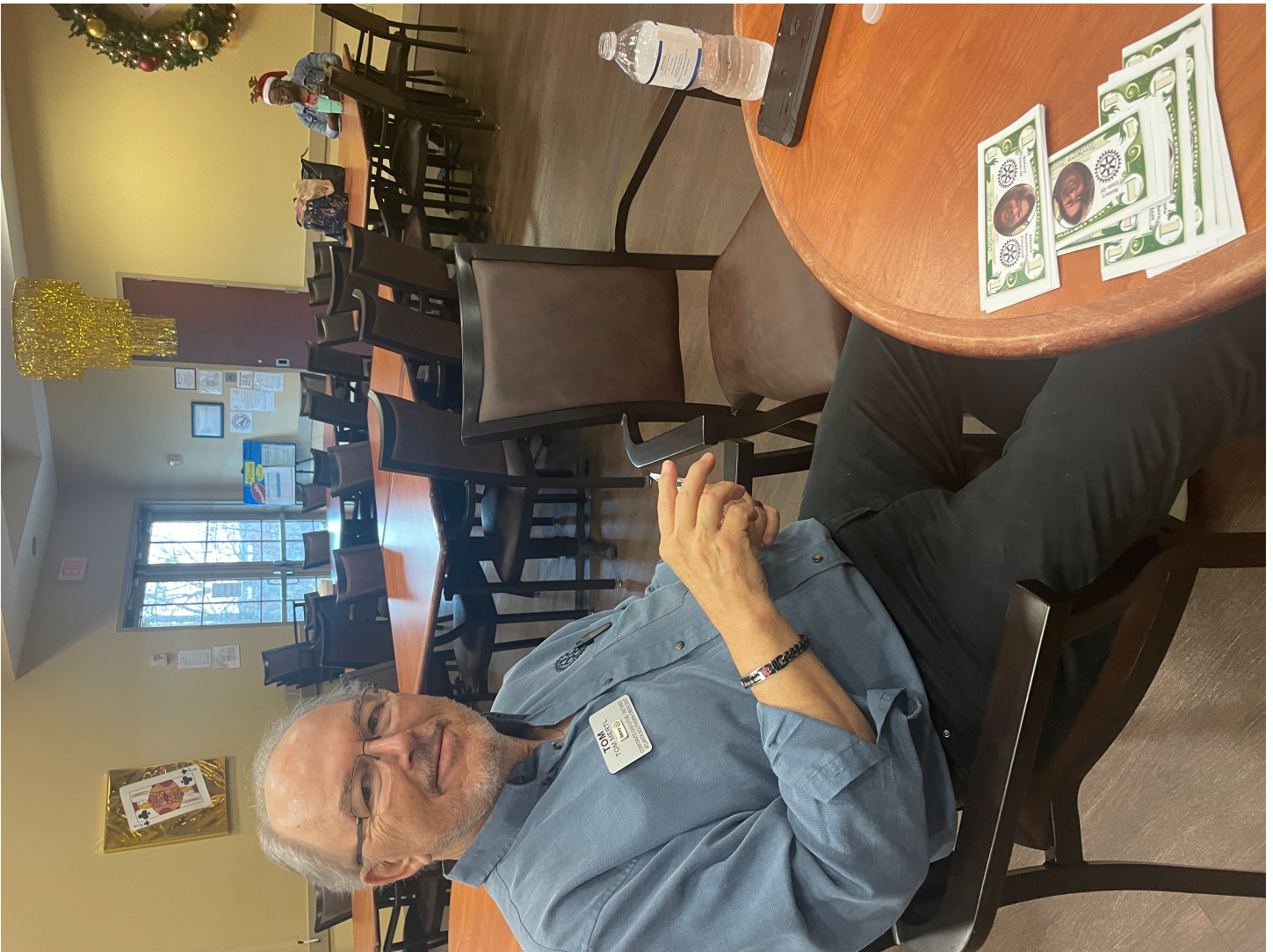
Posted by Claudia Mertl January 3, 2025