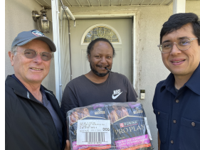
Rotary on the Road